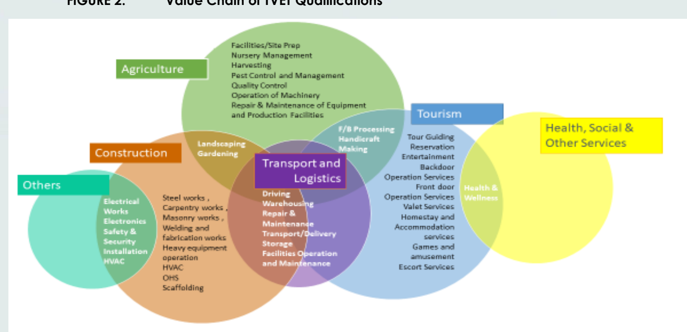
FIGURE 2. Value Chain of TVET Qualifications

Using this model, TESDA can identify common qualifications provided by the country's technical-vocational education and training (TVET) institutions and then prioritize them according to the employment needs described in Table 2. Even further, TESDA can use this model to inform certain